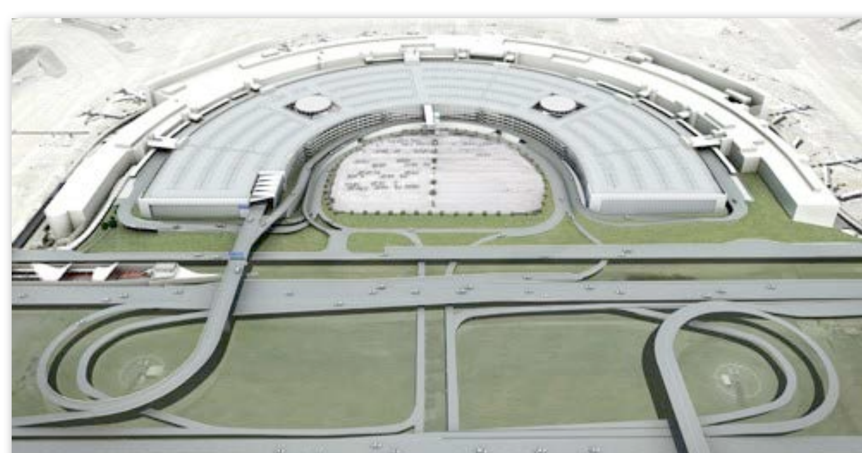
D/FW Terminal A