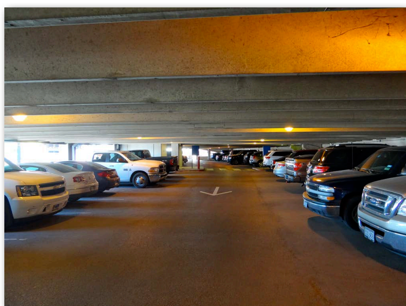
Terminal parking garage without Indect Parking Guidance System